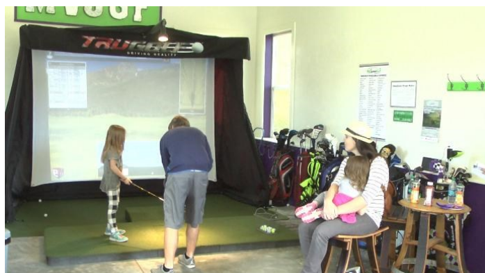
Canyon Springs GC Indoor Practice Facility

The popularity of indoor practice facilities is on the rise in our Section. Brett Cordingley, PGA, recently opened The Golf Barn in Rexburg, Idaho while Bigwood Golf Course in Ketchum, Idaho has also completed their own practice facility. Canyon Springs Golf Course, Twin Falls, Idaho, unveiled their new indoor practice facility last month. Click here for the segment from KMVT in Twin Falls regarding the new Canyon Springs facility.